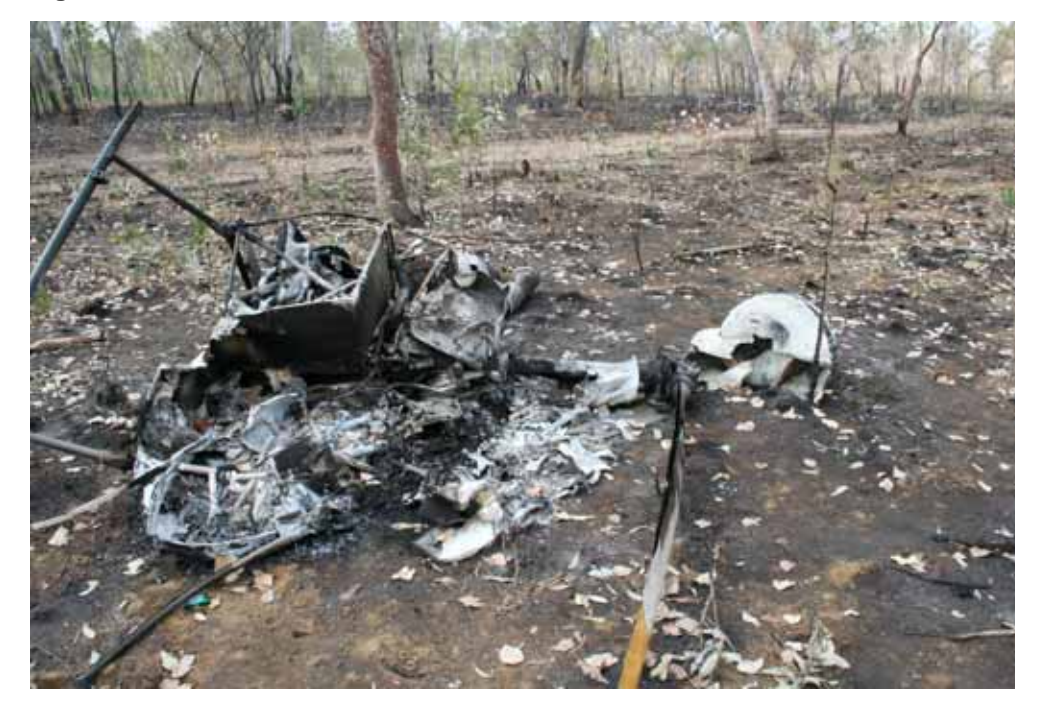
Figure 3: Accident site

The accident site was located in flat, lightly timbered, terrain about 4 km east of Doongan Station. The helicopter initially collided with trees before impacting the ground in a steep nose-down, left skid-low, attitude. The helicopter then came to rest a further 13 m on a bearing of about 240 degrees magnetic. One of the main rotor blades had fractured and separated from the helicopter and was located about 15 m from the wreckage. A severe post-impact fire consumed the majority of the helicopter and also ignited the surrounding vegetation (Figure 3). The resulting bushfire continued for several days and affected both the accident site and large areas of the surrounding environment.