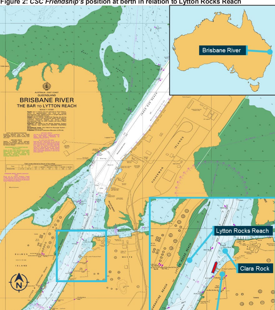
Figure 2: CSC Friendship's position at berth in relation to Lytton Rocks Reach

The ship's mooring winch drums slipped on the brake<sup>4</sup> under the increased load, the ship picked up momentum and surged downstream along the berth. One forward spring line, 2 aft spring lines and an aft breast line parted a short time later. The ship continued to break away downstream, causing the gangway to strike berth loading booms before falling away from the ship's side onto the wharf.