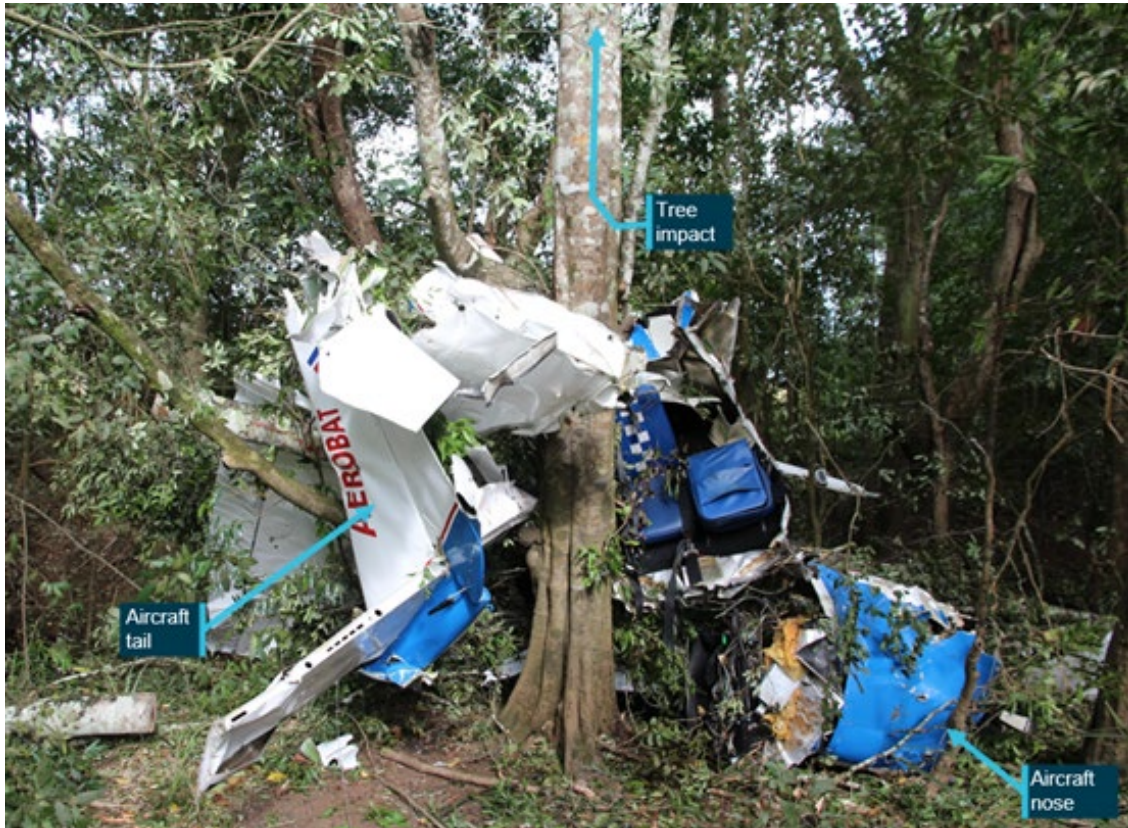
Figure 4: Aircraft main wreckage at the base of a large tree that was struck