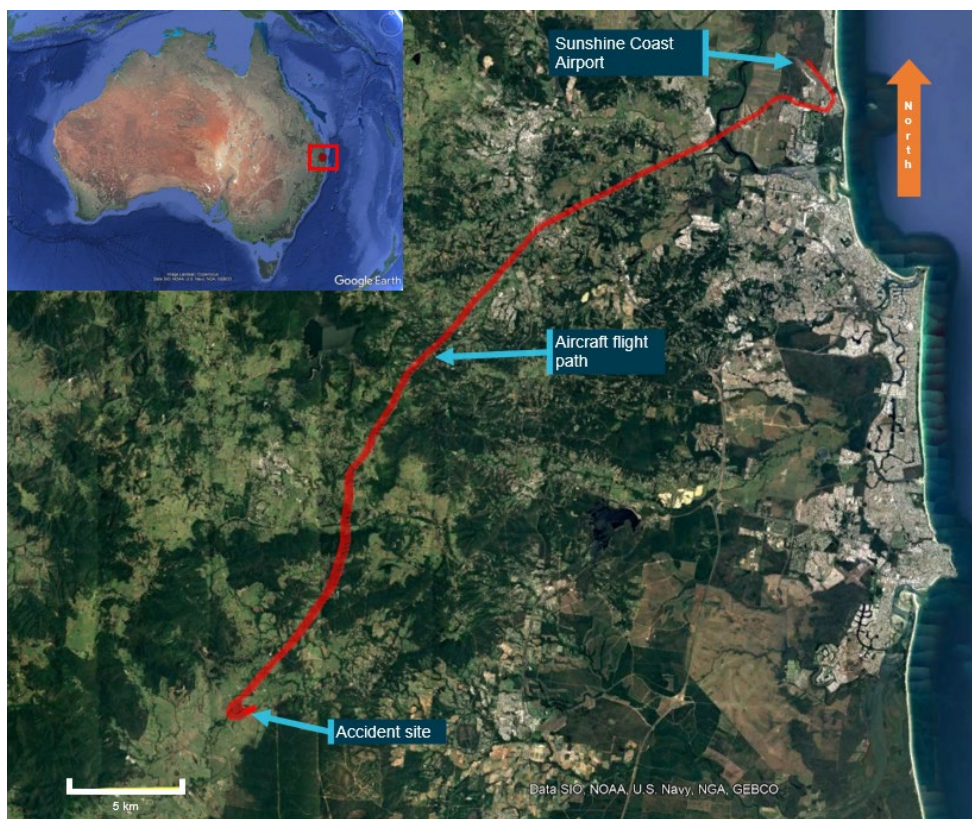
Figure 1: VH-CYO flight track radar data showing take-off point and accident site