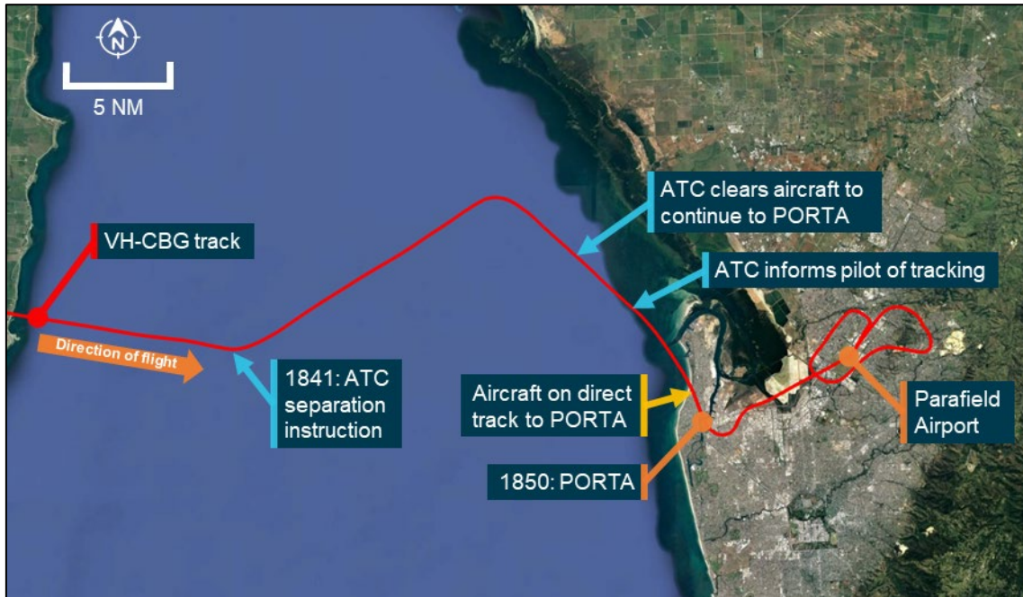
Figure 2: Aircraft track from 1838 to 1901

At 1847, the pilot was instructed to resume navigation to PORTA. The pilot recalled switching the autopilot back to NAV mode to track toward PORTA, but the aircraft continued along the previously assigned heading, about 20° to the left of the track to PORTA. Shortly after, ATC requested the pilot to confirm tracking, and after the pilot acknowledged, the aircraft gradually turned right over the next minute until 1849, when it tracked toward PORTA.