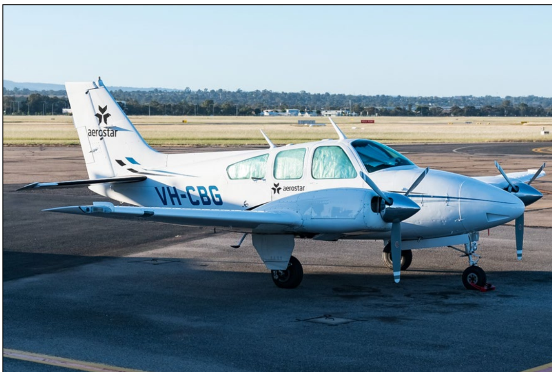
Figure 1: VH-CBG

On 13 May 2021, at 1700 Central Standard Time, 1 a Hartwig Air Beechcraft Baron 95-B55 aircraft, registered VH-CBG (Figure 1), departed Ceduna Airport, South Australia (SA), for a charter flight under the instrument flight rules (IFR) 2 to Parafield Airport, SA, with the pilot and one passenger on-board.