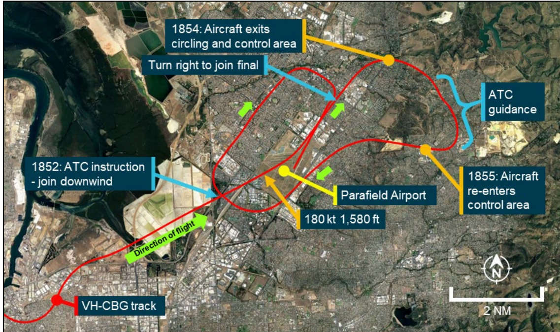
Figure 3: The approach

After the pilot confirmed the intention to return to Parafield, the aircraft continued tracking away from the airport and the controller then instructed the pilot to track direct to the airport, maintain 1,500 ft, and join the upwind leg of the circuit. At 1855, with the aircraft still travelling south away from the airport, the controller requested confirmation that the pilot could see the airport. The pilot acknowledged and turned the aircraft towards Parafield Airport.