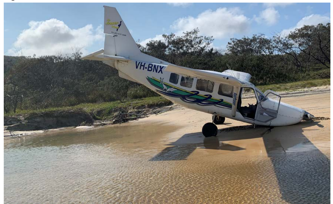
Figure 2: VH-BNX at the accident site

The aircraft sustained substantial damage. There were no injuries to the pilot or passengers. The pilot and front passenger were wearing four-point harnesses and rear passengers wore overshoulder harnesses with lap sash seatbelt. The pilot reported he had verified that everyone was wearing their seatbelts and had headsets on so he could communicate with them before commencing engine start.