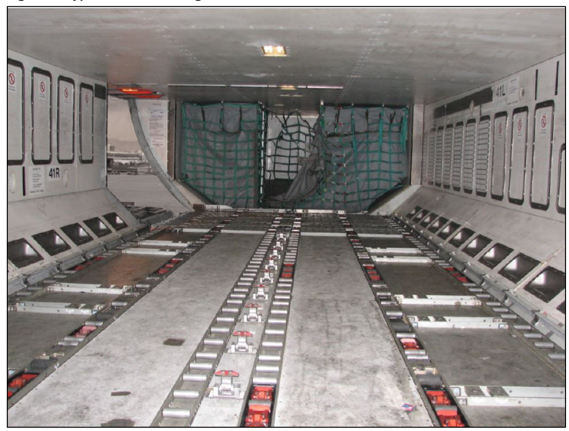
Figure 3: Typical A330-300 cargo hold

For reference only – internal detail of the A330-300 rear cargo hold.