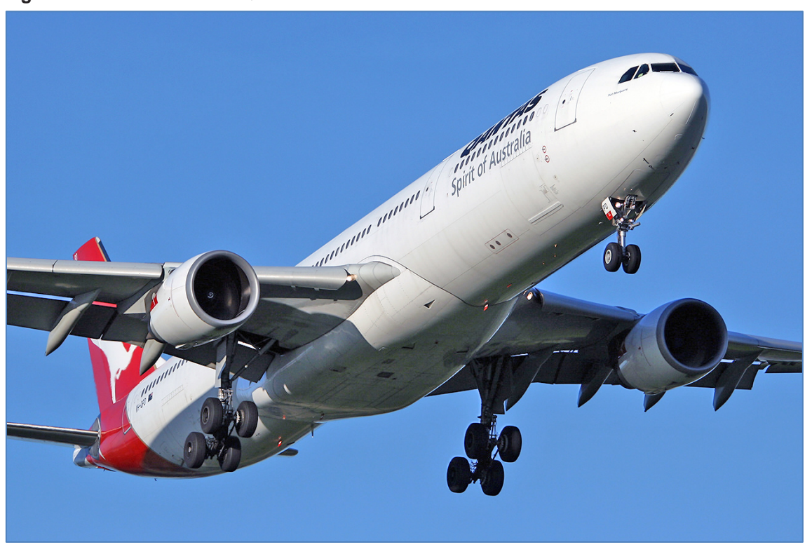
Figure 1: A330 aircraft VH-QPD

On 17 December 2017, an Airbus A330-303 aircraft, registered VH-QPD and operated by Qantas Airways, was being prepared for passenger flight QF107 from Sydney, New South Wales, to Beijing, China (Figure 1). The loading of baggage and freight into the lower hold of the aircraft was conducted as part of pre-departure operations. The aircraft departed from the international terminal at Sydney Airport at 1346 Eastern Daylight-saving Time. After landing in Beijing, the operator's freight agents identified that the aircraft had been loaded incorrectly. An incorrect freight pallet resulted in the aircraft exceeding its maximum take-off weight on departure from Sydney.