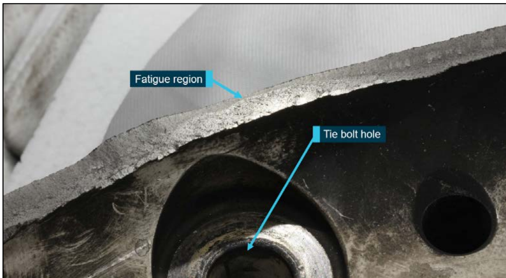
Figure 3: Outboard fracture surface on the inner half-wheel, with a fatigue region