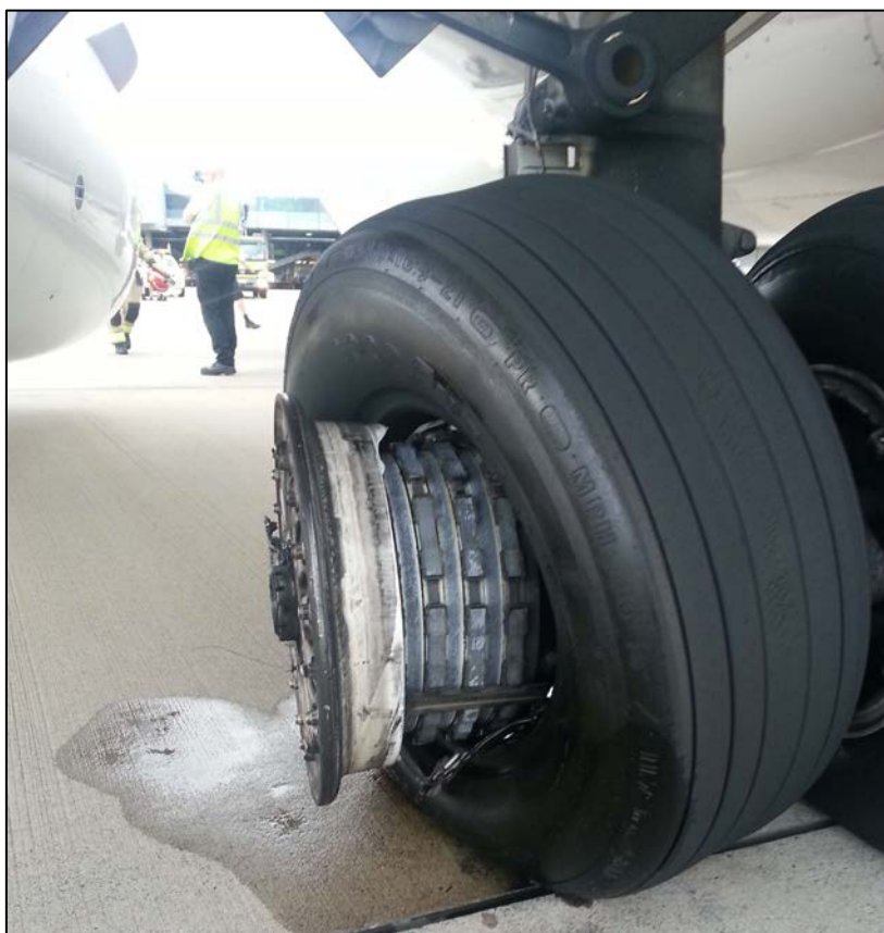
Figure 1: Damage to the number one main wheel assembly on VUH

On 4 January 2017, a Boeing 737-8FE, registered VH-VUH (VUH) and operated by Virgin Australia Pty Ltd (Virgin), was scheduled to fly from Brisbane, Queensland to Melbourne, Victoria. Prior to take off, at approximately 1710 Eastern Standard Time, 1 VUH was holding on B3 taxiway when one of the main wheels experienced what was believed to be a burst tyre. The flight crew began to taxi the aircraft back to the gate. An attending engineer instructed the flight crew to stop the aircraft before reaching the gate, as they noticed the number one main wheel assembly (left-hand outboard wheel) had failed (Figure 1).