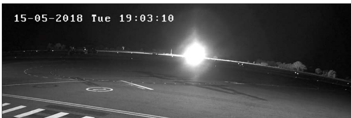
Figure 3: Deflagration of fuel vapour