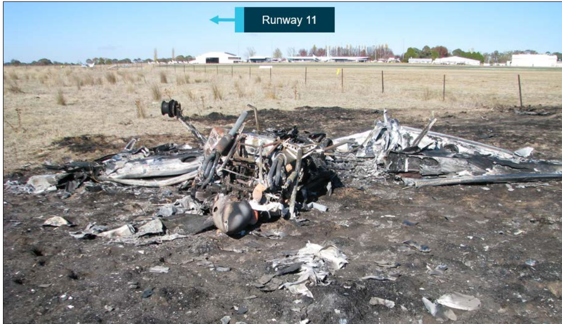
Figure 1: VH-PDC wreckage

The pilot reported that he ‘kicked the pilot’s door window out’ to exit the aircraft, at which stage the wings were alight and a grass fire had started. 11 He then pulled the instructor out of the wreckage, who had lost consciousness after becoming disorientated while looking for the emergency egress hammer. 12 Emergency services located at the airport immediately responded to the accident. Figure 1 shows the wreckage site with reference to runway 11. Weather conditions were not considered a contributing factor to the accident.