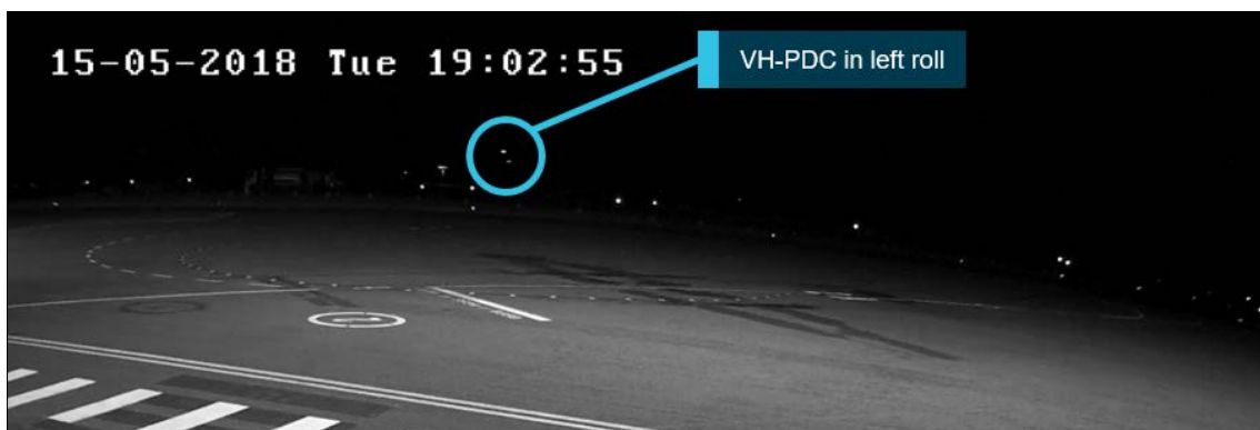
Figure 2: VH-PDC in left roll