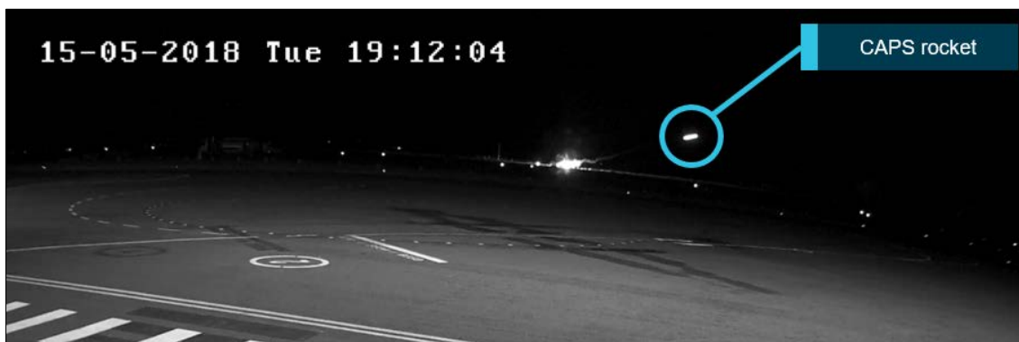
Figure 4: CAPS rocket