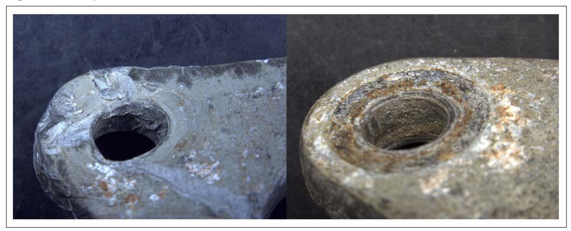
Left: bolt-hole for the missing fastener. Right: bolt-hole for a removed fastener.