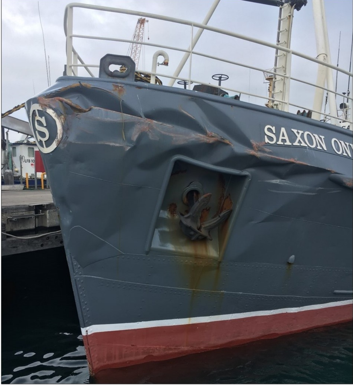
Figure 5: Saxon Onward, alongside in Eden