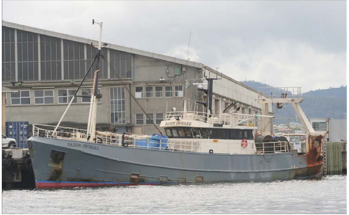
Figure 1: Saxon Onward, alongside in Hobart, Tasmania, 2010

On 23 January 2018, at about 0015 Eastern Daylight-saving Time, 1 the fishing vessel Saxon Onward (Figure 1) collided with the container ship Beijing Bridge (cover) about 3 nautical miles (NM) south-east of Gabo Island, Victoria. Saxon Onward was bound for Eden, New South Wales while Beijing Bridge was en route to Melbourne, Victoria from Taiwan.