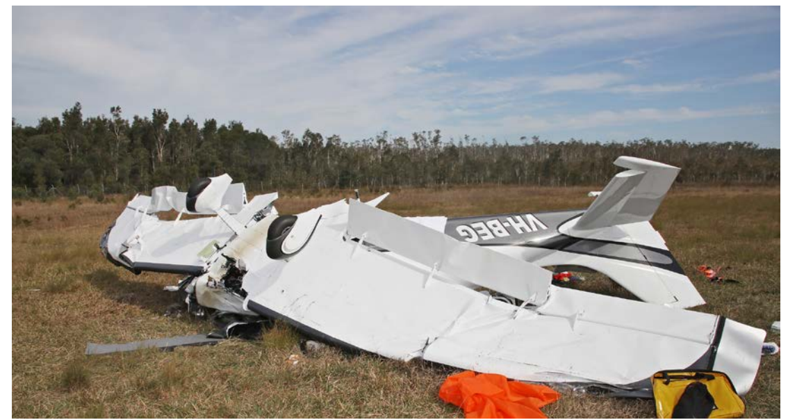
Figure 1: The Airplane Factory Sling 4 amateur-built aircraft, registered VH-BEG

The aircraft came to rest inverted and was destroyed (Figure 1). The pilot and all three passengers suffered serious injuries.