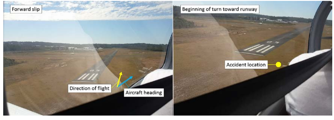
The figure shows images of the aircraft during the approach prior to the accident. The aircraft is shown in a forward slip (left) and at the beginning of the turn toward the runway 05 threshold (right).

The aircraft approached the runway threshold on a heading of about 010 degrees magnetic, and appeared to be undershooting the threshold. Pitch angle then increased, an aerodynamic stall occurred, and the aircraft rolled rapidly left. As the aircraft rolled, the slip indicator displayed a full right deflection, indicating that the aircraft had entered an incipient left spin. The footage stopped as the left wing impacted the ground.