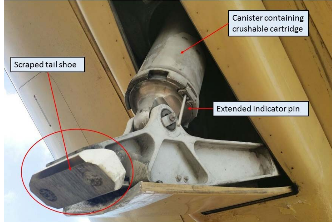
Figure 1: Damage to tail skid

Subsequently, an uneventful landing was carried out in Singapore. Engineers conducted a postincident inspection of the aircraft and found no damage to the aircraft fuselage. Damage was evident to the tail skid system with indications of a scraped tail shoe, compression of the crushable cartridge and one indicator pin extended (Figure 1). This damage indicated that a moderate energy skid contact had occurred during take-off.