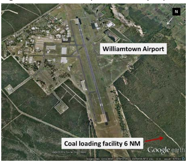
Figure 2: Williamtown (Newcastle Airport)