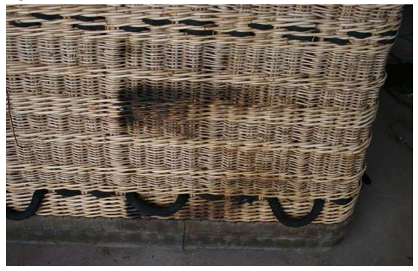
Figure 1: Scorch marks on wicker basket

The pilot checked that the passengers were all ok and still in the landing position, and checked that there was no evidence of fire. Due to the amount of heat in the balloon, the balloon was climbing. The pilot then conducted a normal controlled descent and landing into a paddock about 500 m beyond the original planned landing site. The balloon landed without further incident and no one was injured. The wicker basket sustained scorching (Figure 1) and a stainless steel cable fixed to the underside of the basket sustained arc damage.