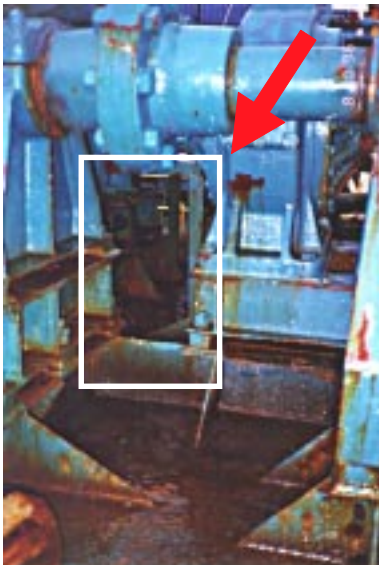
View from front of windlass showing opening through which Chief Officer passed