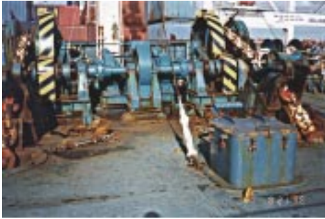
View of windlass from forecastle head