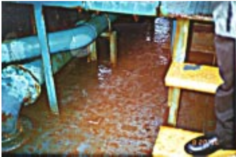
Position under windlass platform where Chief Officer was found