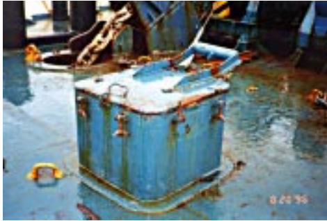
The booby hatch on forecastle head