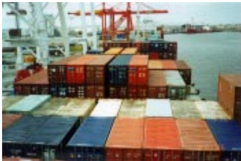
View forward from the bridge (some containers already discharged)