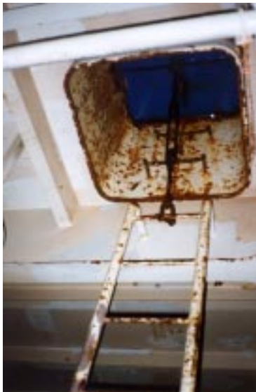
Booby hatch viewed from within the forecastle (bottlescrew in position)