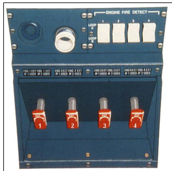
Figure 11: Illustration 11 of the overhead fire panel within the flight deck

Instruction, familiarisation and experience using the engine fire protection system is provided to flight crews through flight simulator training, during which they are exposed to normal, abnormal and emergency situations and procedures. To maintain currency, company pilots complete recurrent training in the simulator every 6 months. That training included manipulation of the fire handle in response to simulated engine fire conditions. While the fire handle in the simulator is not connected to a cable or mechanical linkage, the handle was designed to be manipulated in the same manner as an actual RJ70 aircraft. The fire handle in the training simulator may become worn through constant use, and consequently over time require less force during operation in order to extend and rotate the fire handle beyond the initial detent.