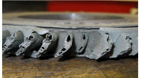
Figure 7: Close-up of burn through of stage-2 HPT nozzle guide vane