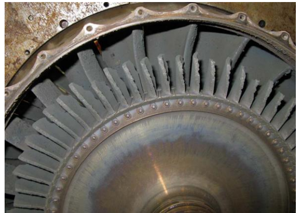
Figure 8: Thermal damage and metallization of the stage-3 LPT showing blade tip separation