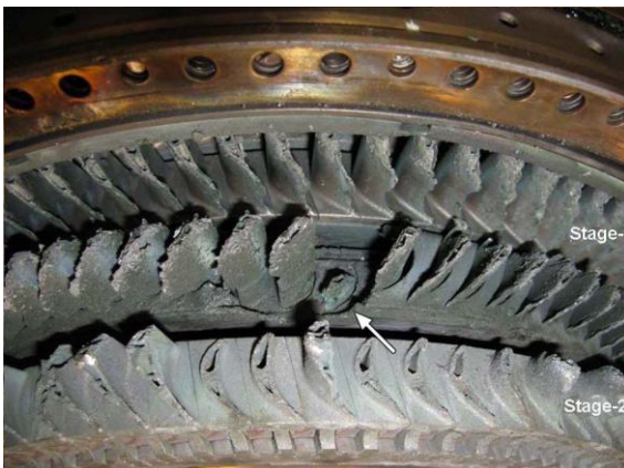
Figure 6: Severe heat damage to the stage-1 and -2 HPT, showing burn through of a stage-2 nozzle guide vane at the 6 o'clock position (arrowed)