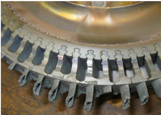
Figure 5: Stage-2 HPT blade separation