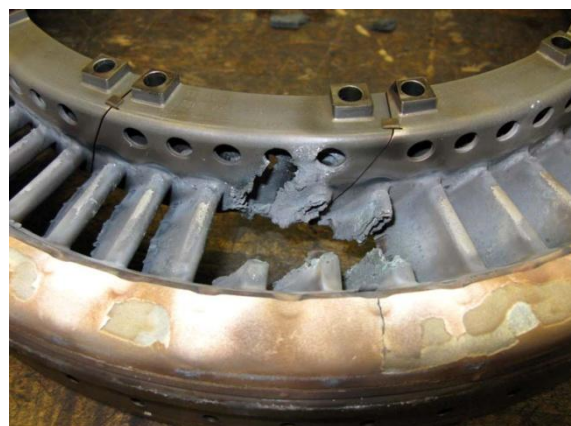
Figure 3: Stage-1 nozzle guide vanes showing burn through at the 6 o'clock position

Also noted in the manufacturer's teardown report was that the 'A' system ignition igniter harness failed when electrically tested – a possible factor contributing to the reported difficulty starting the number-2 engine in the preceding months.