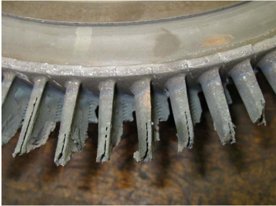
Figure 4: Stage-1 HPT with leading edge vane erosion and melting