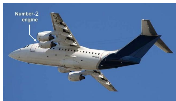
Figure 1: Photograph 4 of VH-NJT showing the engine configuration

The Avro-RJ70 aircraft, serial number E1228, was manufactured in 1993 by British Aerospace (BAe) of the United Kingdom (UK) (Figure 1). The RJ70 was originally developed from the BAe 146-100 aircraft platform. Both types shared a virtually identical configuration; however, the RJ70 was fitted with higher power engines and digital avionics.