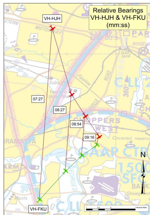
Figure 3: Lack of relative motion between VH-HJH and VH-FKU.

The flightpaths of both occurrence aircraft were such that the relative motion was not obvious to either pilot (Figure 3).