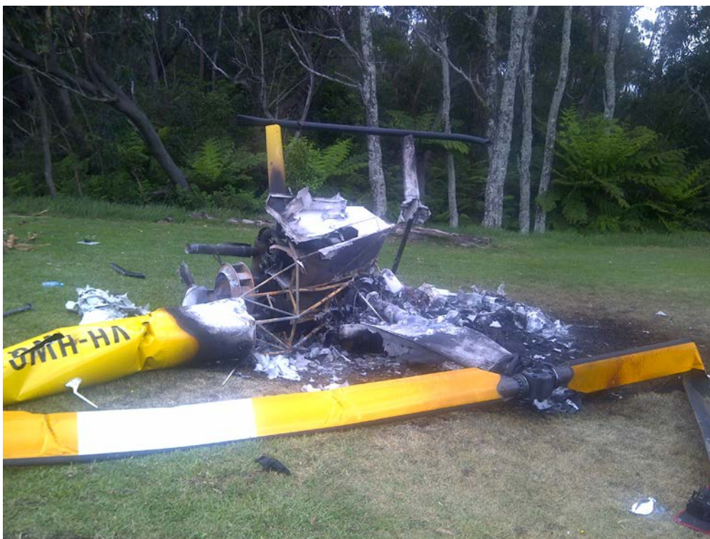
Figure 3: Main wreckage