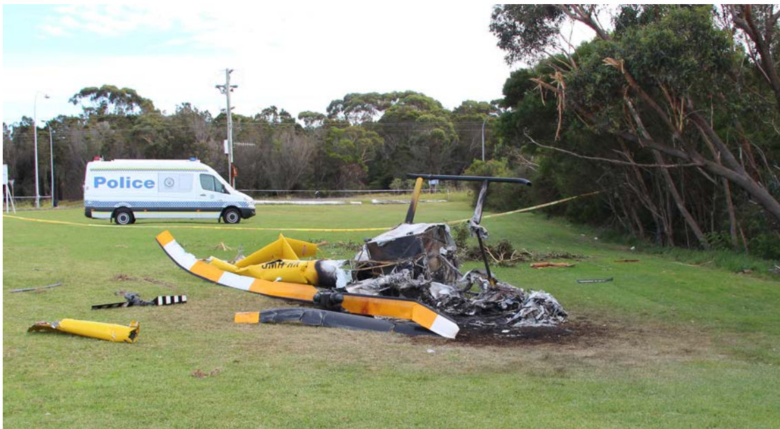
Figure 1: Wreckage with the broken tree branches in the background

The helicopter was then observed to descend onto the grass and roll over onto its right side. Soon after, a fire started on the grass under the rotor mast and the cabin. A number of witnesses attempted to extinguish the fire and remove the occupants, but were unsuccessful due to the intensity of the fire. The pilot and three passengers were fatally injured and the helicopter was destroyed.