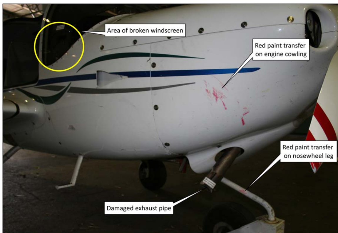
Figure 4: Damage to Liberty nose cowling and paint transfer