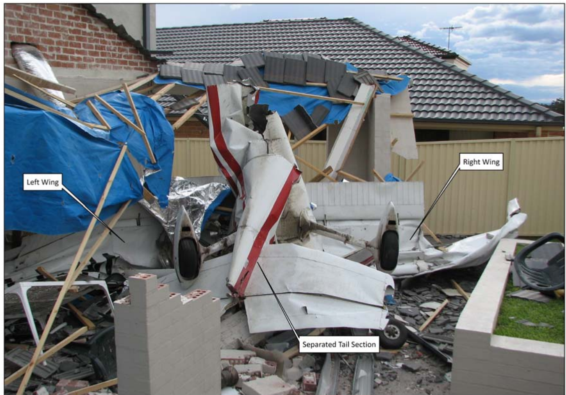
Figure 2: Cessna wreckage and house damage

A detached section of vertical fin from the Cessna had come to rest between two houses in an upright position after impacting the roof of a house to the west of the impact location. The