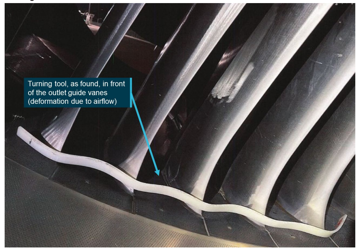
Figure 1: Location of the turning tool as found in front of the low-pressure compressor outlet guide vanes