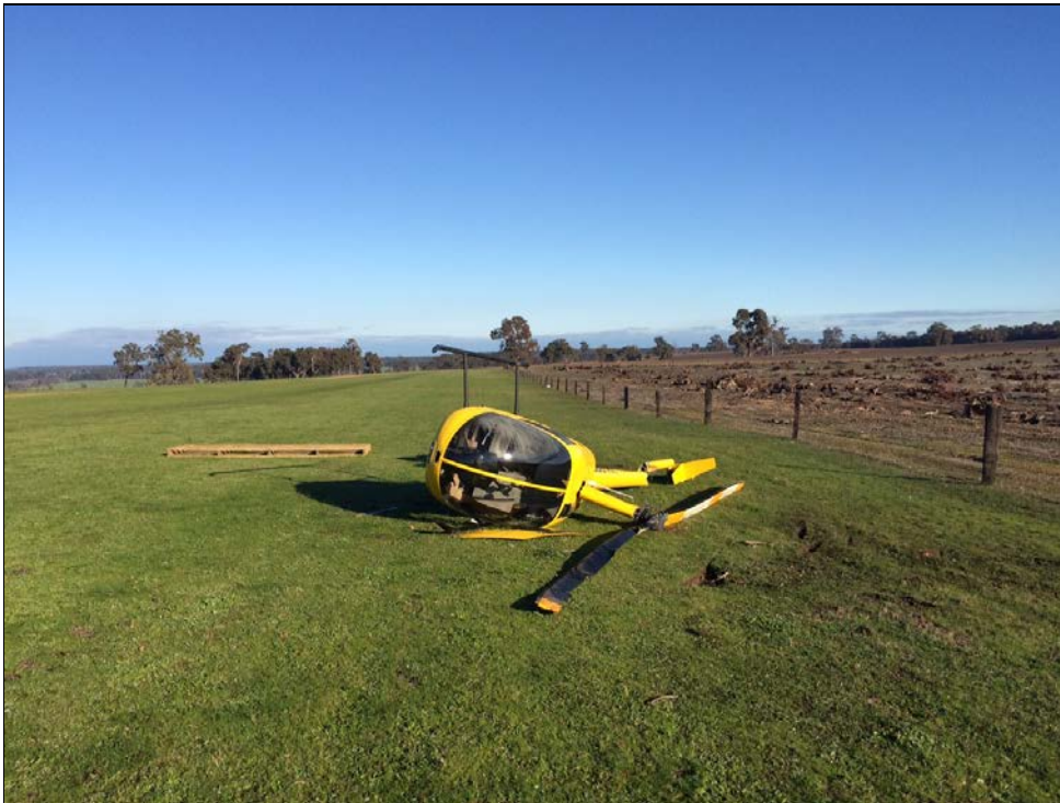
Figure 2: VH-RBT at rest on the left side. Note the broken tail boom and rotor blades

Now about 30-40 ft above the ground, the pilot elected to put the helicopter back on the ground. Manoeuvring slightly left to avoid the assumed position of the drain, the pilot unexpectedly felt the tail and rear skids of the helicopter strike the ground. The pilot stated this was a heavy collision, and resulted in the helicopter bouncing back into the air. The pilot applied some collective and the helicopter bounced again then yawed rapidly to the right. The pilot applied full left pedal in an attempt to prevent the helicopter from entering a spin, however the yaw continued, so the pilot rapidly reduced the throttle to idle. As the yaw decreased, the helicopter fell onto its left side (Figure 2).