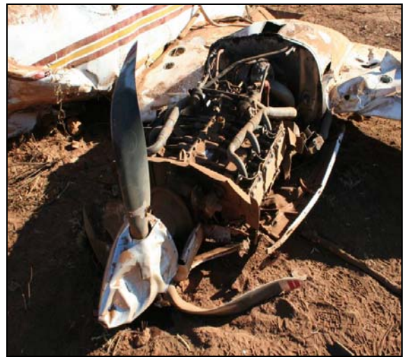
Figure 5: Right engine and propeller