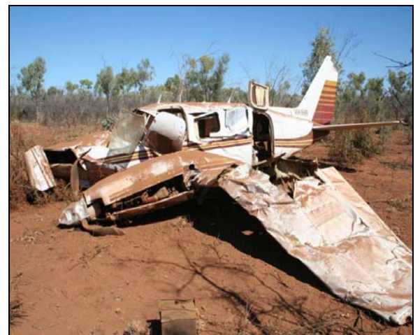
Figure 2: Aircraft wreckage

The flaps were in the zero (retracted) position as was the cockpit flap indicator and selector. Damage to the landing gear doors indicated that