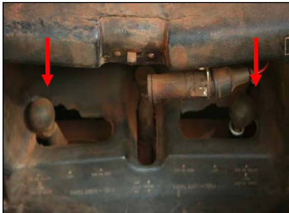
Figure 3: Fuel management panel

Due to extensive structural damage of the left wing, both left wing fuel tanks had ruptured, resulting in the remaining fuel in that wing draining into the ground. There were indications of fuel draining into the ground under the inboard fuel tank but not under the outboard fuel tank.