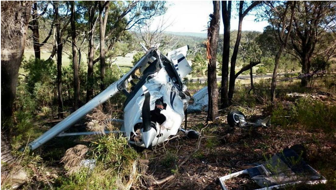
Figure 2: Aircraft wreckage

During his approach to land on the selected paddock, with full flap selected, the pilot found himself overshooting the selected aim point. He endeavoured to recover the profile, but had increasing difficulty maintaining the preferred aim point. Concerned that he would not be able to land safely, the pilot elected to discontinue the approach and commenced a go-around. As the go-around proceeded however, the pilot found that he was unable to climb over trees ahead of the aircraft on rising terrain beyond the far end of the selected paddock. He was able to manoeuvre around a small number of individual trees, but collided with a line of trees, slightly further on. The aircraft was substantially damaged in the collision (Figure 2) and the pilot received serious injuries.