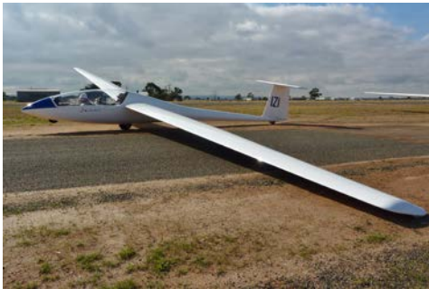
Figure 1: VH-IZI and VH-KXS

At about the same time, the pilot of a McDonnell Douglas 500N helicopter, registered VH-KXS (KXS), was conducting circuits (Figure 1). He was on his fifth circuit and had reported broadcasting on the common traffic advisory frequency (CTAF) immediately prior to turning base for runway 19. 1